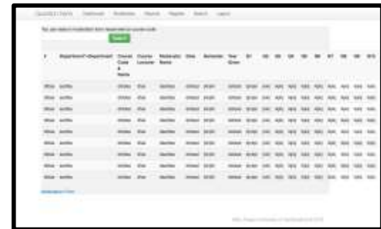
Moderator Report Form