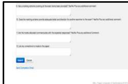
Moderation Form Bottom