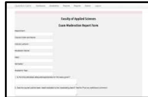
Moderation Form Screen