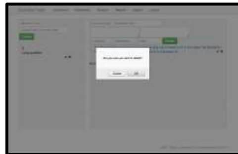
Delete Record Screen