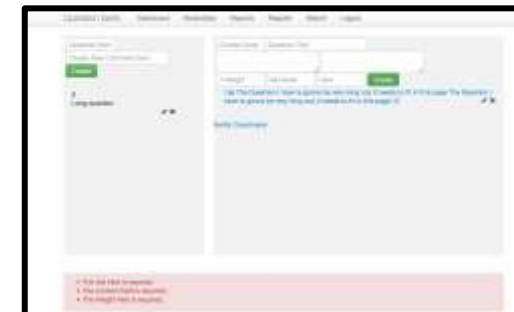
Error Message Screen